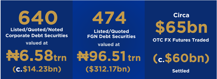
Figures as at April 30, 2023